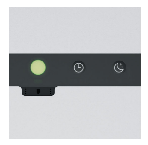
HIGH QUALITY CONTROL PANEL Control in an intuitive and comfortable way. Functions: on / off, auto /manual / turbo, timer, night mode.