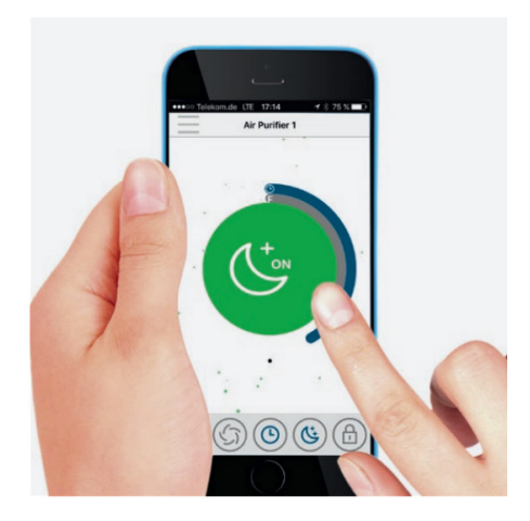
IDEAL AIR PRO APP <sup>1</sup> Enable more control of your device with the IDEAL Air PRO app. Available at Google Play & Apple App Store.

The current air quality is indicated in a three color code via LED. Depending on the air quality, in automatic mode, the intelligent process controller regulates the cleaning performance and controls the filter.